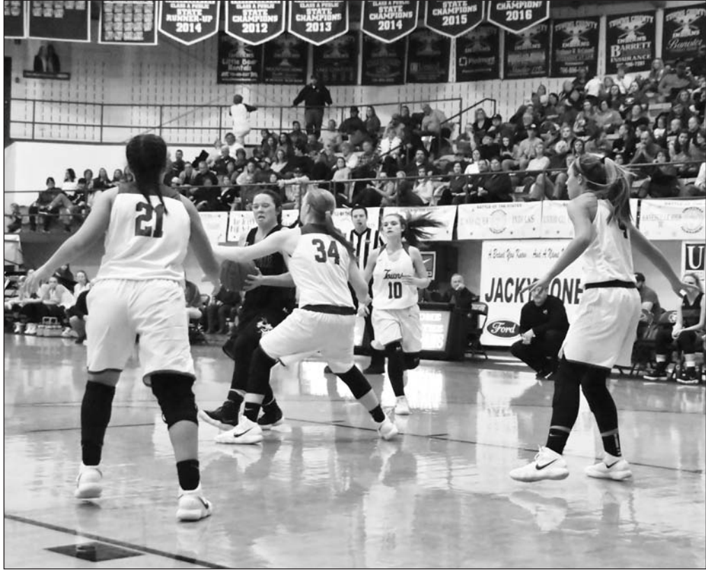
The Lady Indians defense clamps down on the Lady Yellow Jackets during their first round BOTS win.